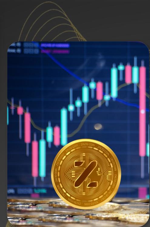
CEX / DEX